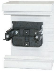
Fig. 1 Mounting support for horizontal installation without separator