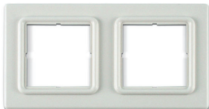
Cover frame 2 port