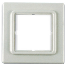
Cover frame 1- port