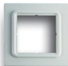
Surface mounted box for data outlet